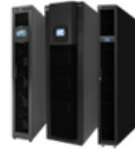
Computer Room In-Row