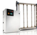
Duct Dist. Adiabatic