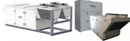
Packaged Rooftop and Vertical/Horizontal Indoor Climate Control Systems