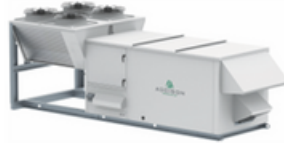
Packaged DOAS with Dehumidification